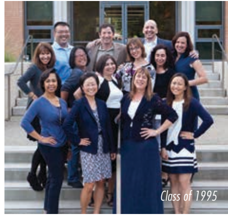
Class of 1995