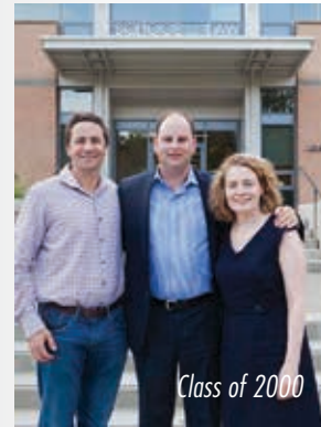
Class of 2000