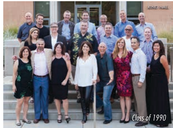
Class of 1990