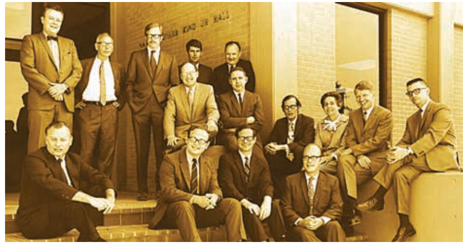
UC Davis School of Law Faculty, 1970