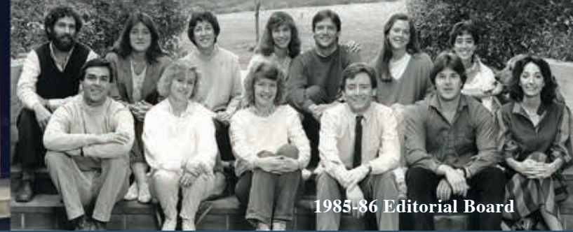
1985-86 Editorial Board

component of our constitutional order. The reforms proposed in this provocative Barrett Lecture have played a significant role in the ongoing national debate on the continued vitality of the jury."