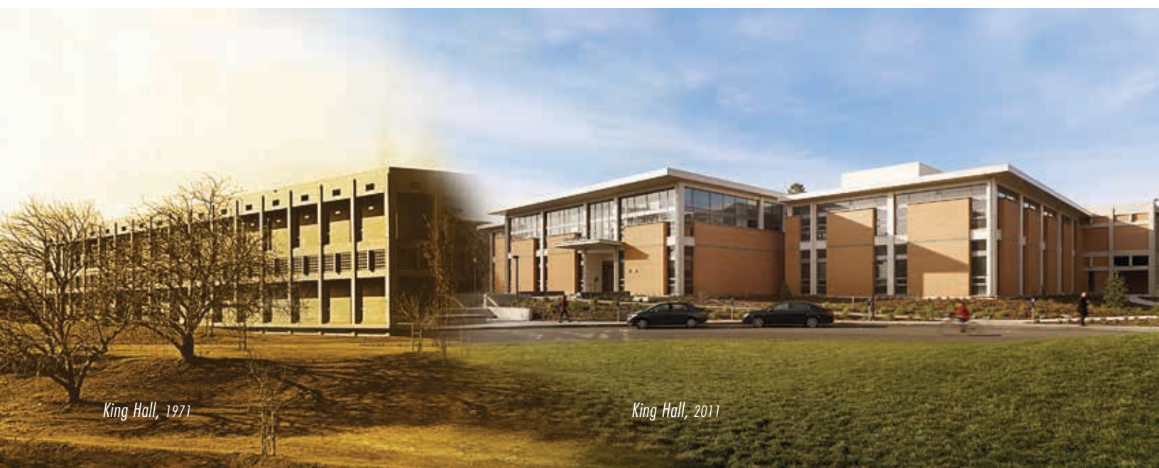
King Hall, 1971