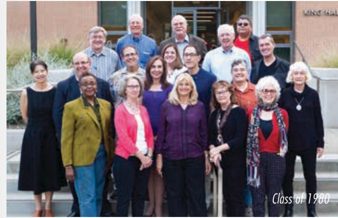
Class of 1980