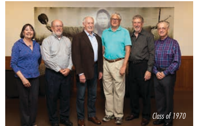
Class of 1970