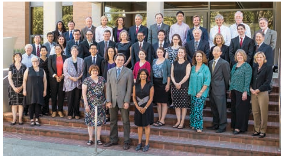
UC Davis School of Law Faculty, 2015