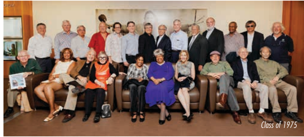
Class of 1975