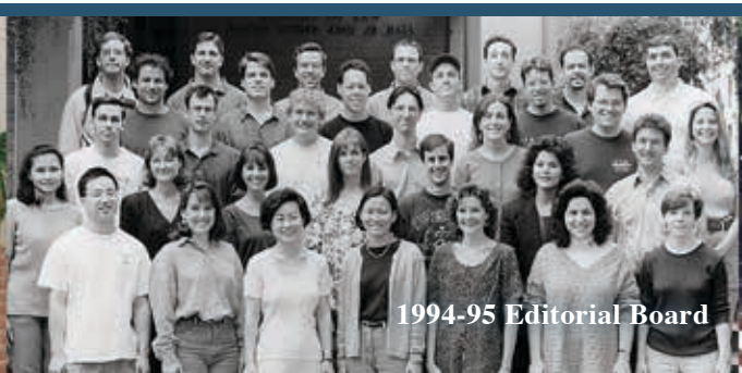
1994-95 Editorial Board