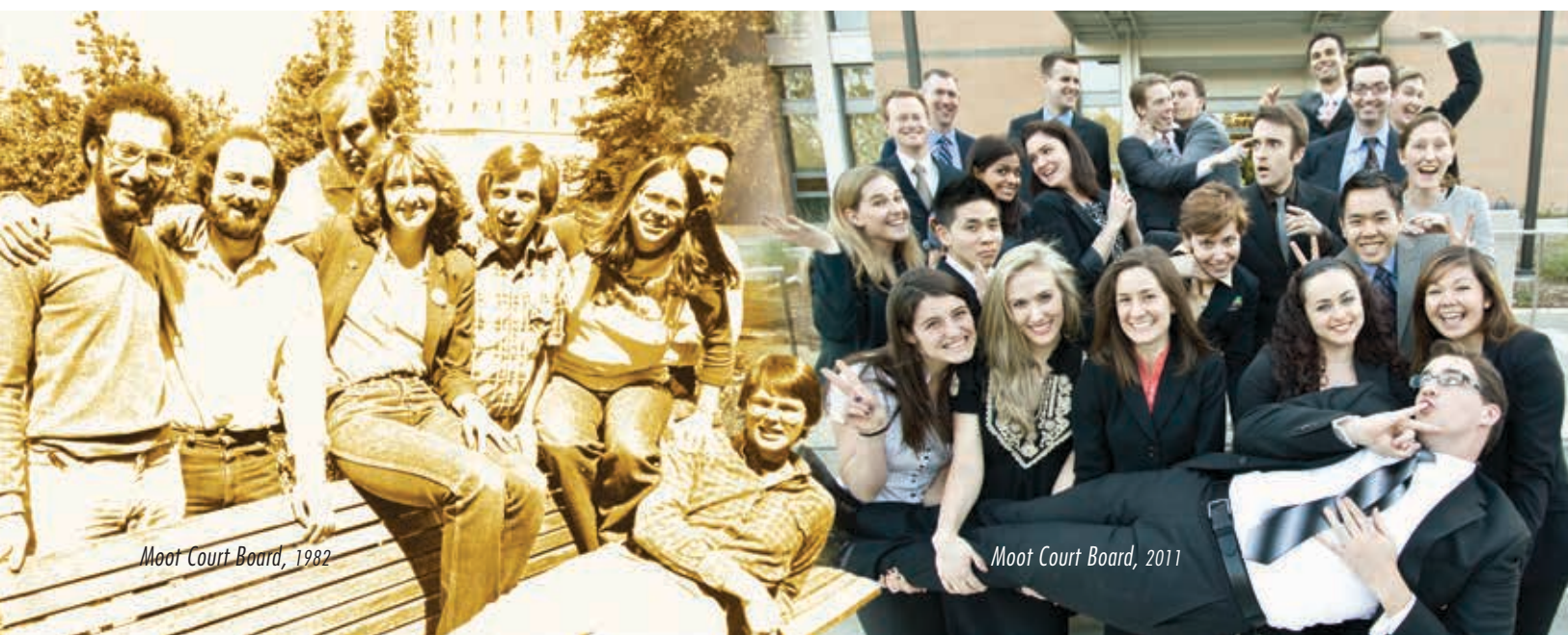
Moot Court Board, 1982

The UC Davis School of Law community represents a wonderful melding of its component parts to deliver excellence and caring on a consistent basis. Anyone wanting to invest time or money in a place where the duality of excellence and caring currently thrives and gets transmitted forward to future generations can trust that King Hall is such a place. 50