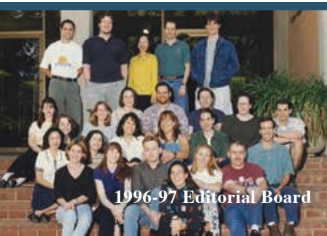
1996-97 Editorial Board

All of the articles, so divergent in subject matter, are united by their enduring timeliness. For fifty years the UC Davis Law Review has been moving the law forward, word by word, cite by cite. ■