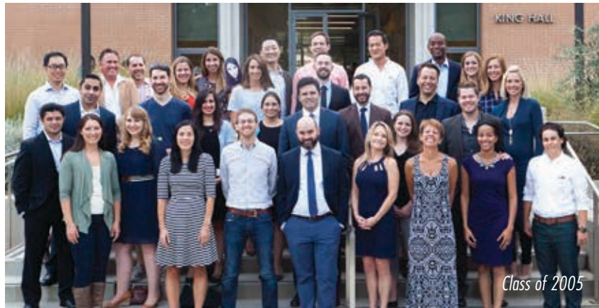
Class of 2005