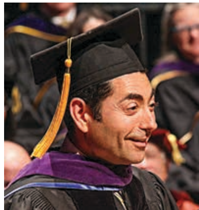
Justice Mariano-Florentino Cuéllar