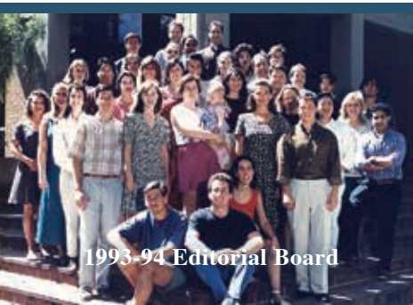
1993-94 Editorial Board