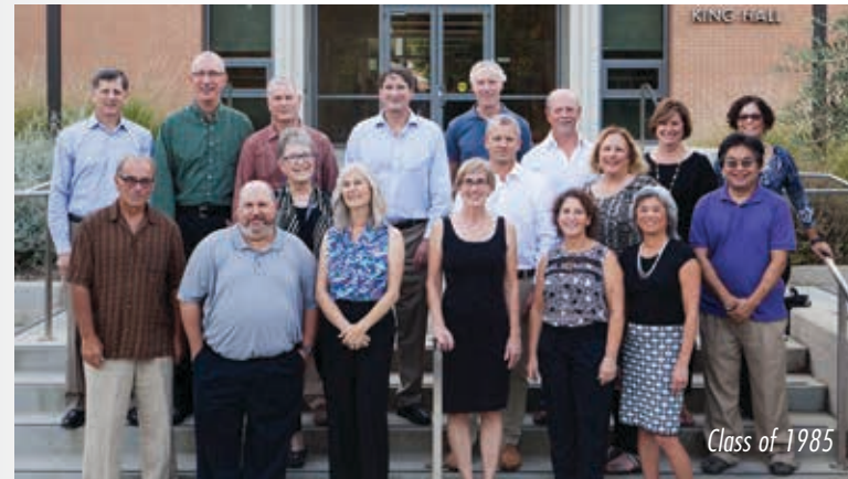
Class of 1985