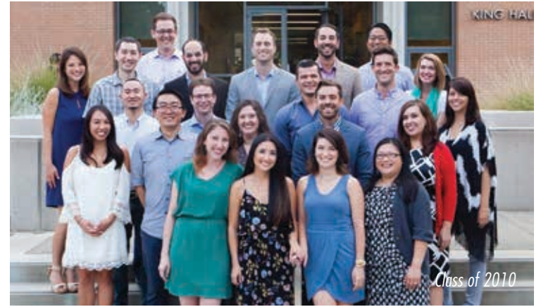
Class of 2010