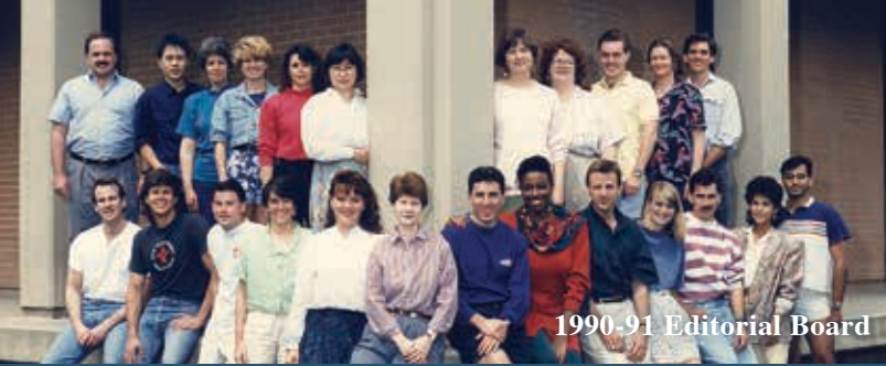
1990-91 Editorial Board