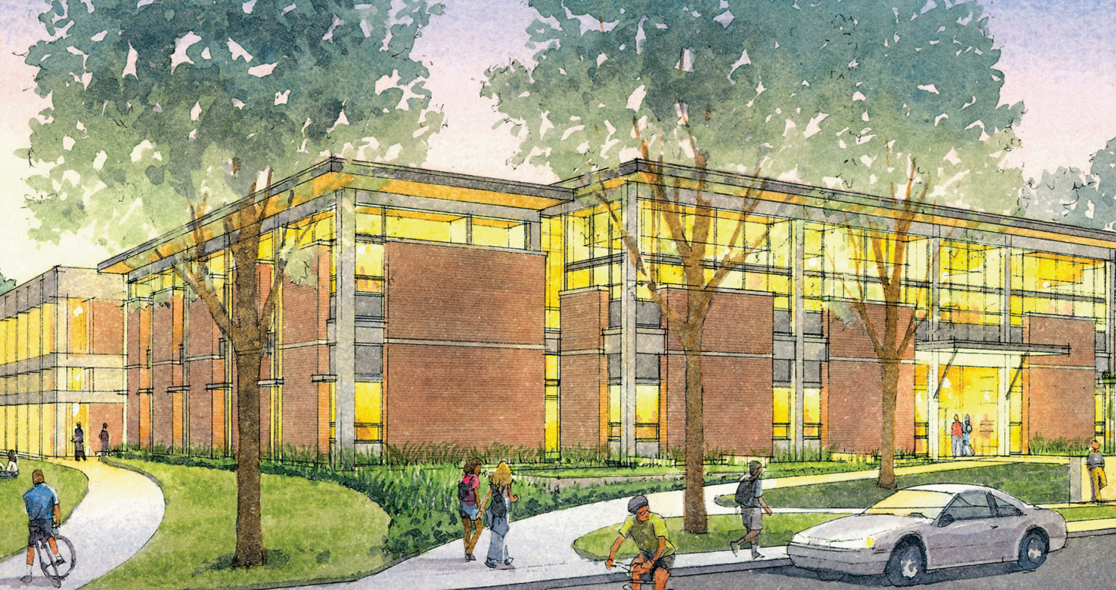
Artist's rendering of the front of King Hall's expansion