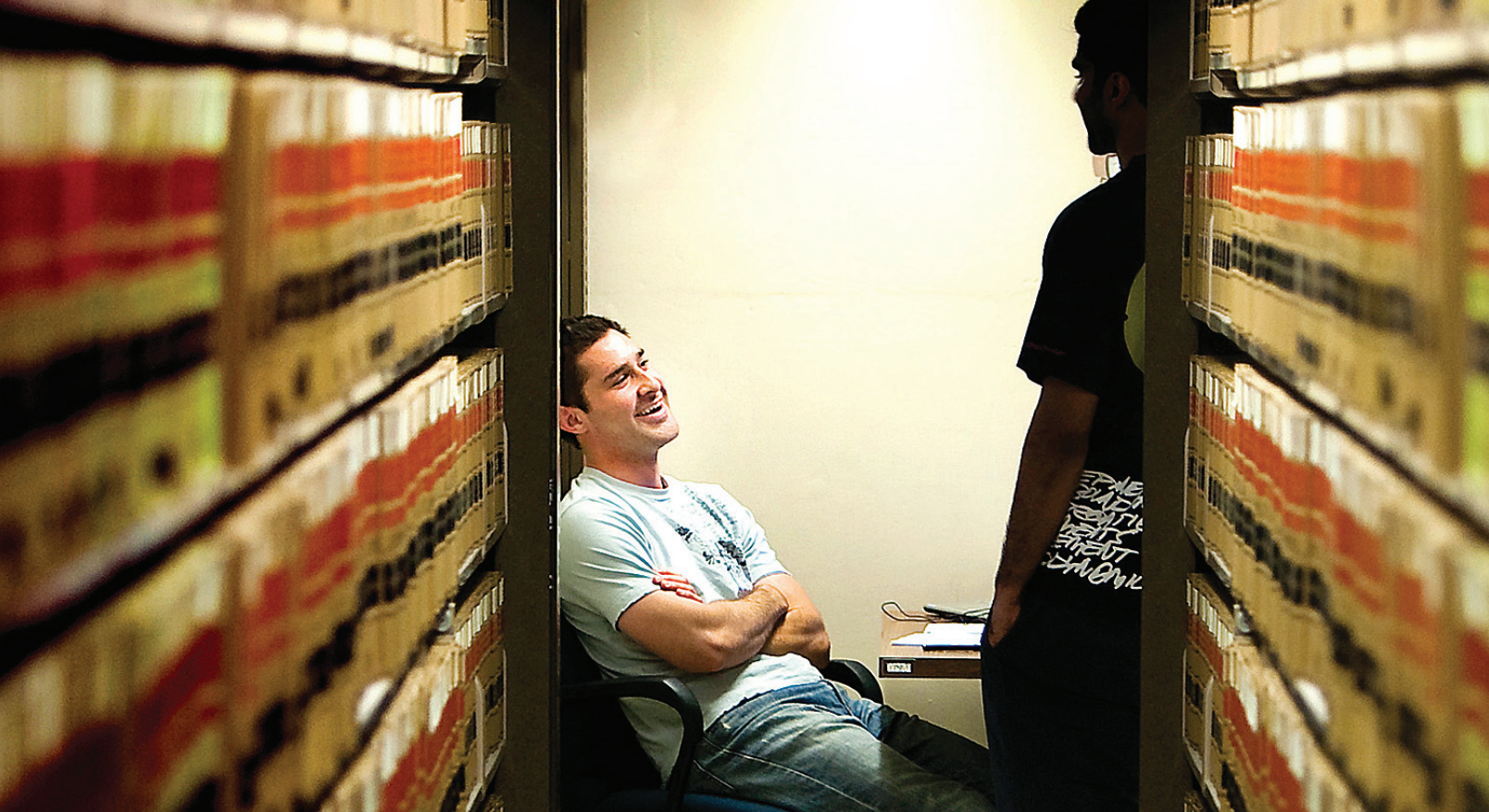
Mabie Law Library, UC Davis